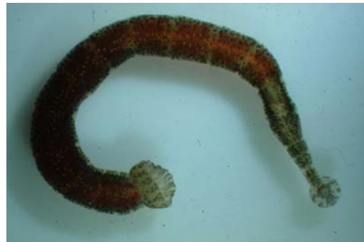
A close up of Piscicola geometra .

Leeches are segmented worms with long, slender, flexible bodies. They are usually 15-30mm in length and can easily be seen. They are brown with suckers at each end of the body. These suckers are used to attach to the fish and they enable the leech to move freely over the body surface. The leech usually attaches to the flanks or belly of a fish. They can also be found in sheltered areas such as on the gills and in the mouth. They have a simple life cycle. Leeches are common parasites in fisheries. The most frequent species in the UK is Piscicola geometra which can infect most species of fish.