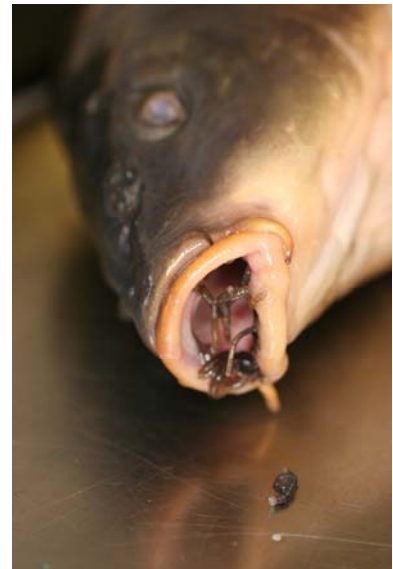
Piscicola geometra in the mouth of a common carp.

Leeches rarely cause problems to whole populations of fish. When this does occur however, leeches are seen to be indicators of other problems within the fishery. If present in high numbers (especially in the warmer months), disease, poor habitat, and overstocking are issues that can make leech problems worse.