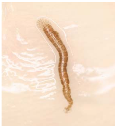
A leech attached to a fish.

A healthy fish can avoid these parasites, whereas sick fish cannot. If a fish is sick and resting on the bottom of a fishery, it is easy for leeches to attach to it. This is also the case during the colder months when fish are less active, (low numbers are commonly seen by pike anglers in the winter) and are spending more time conserving energy on the bottom of a fishery. Leech infections may be higher due to the fish being in a dormant state.