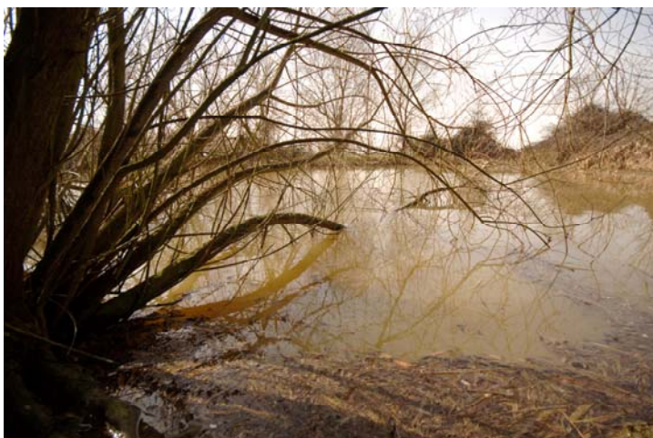
A build-up of leaf litter in a lake can cause water quality problems.

Low levels of oxygen occur if there are not enough submerged aquatic plants, high stock densities and high levels of silt. The amount of oxygen can be further reduced by the presence of bacteria through: