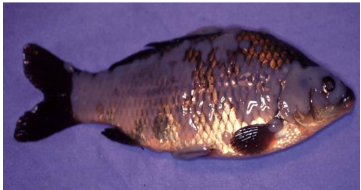
A crucian carp with a carp pox infection.

For more information about monitoring water quality managing stock density, and good habitat, see the relevant fact sheets in this series.