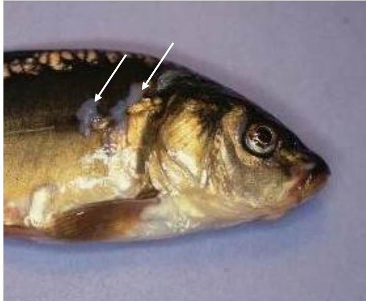
A mirror carp with a low level of carp pox (arrowed).

It is caused by a virus known as Cyprinid Herpesvirus-1. It is a common disease of common carp, but can affect all varieties of carp. It may affect other cyprinids such as barbel, bream, crucian carp and rudd. It is a long-lasting, but normally non-fatal skin disease which leads to the abnormal multiplication of mucus cells. Fish infected with carp pox are thought to be infected for life, but the disease only occurs at certain times of the year when conditions are right.